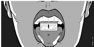
Pan Seur Ni Panique